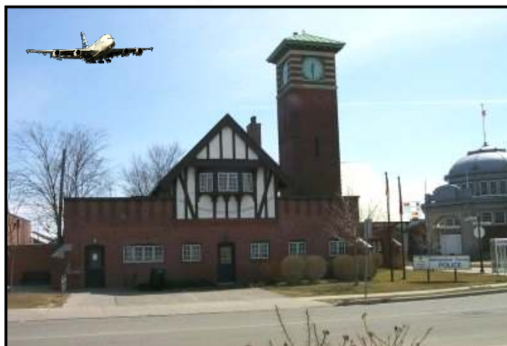
The Sub Station at Exhibition Place 275 Manitoba Dr. 416-808-1500