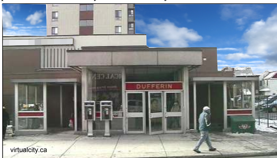
Dufferin Station – scene of sexual assault . The suspect was arrested at Yonge.

The suspect exited the train when the subway arrived at the Yonge station. The victim was able to locate the suspect who was sitting in another train. He was arrested by TTC Special Constables. He scheduled to appear in court at Old City Hall on February 20 th .